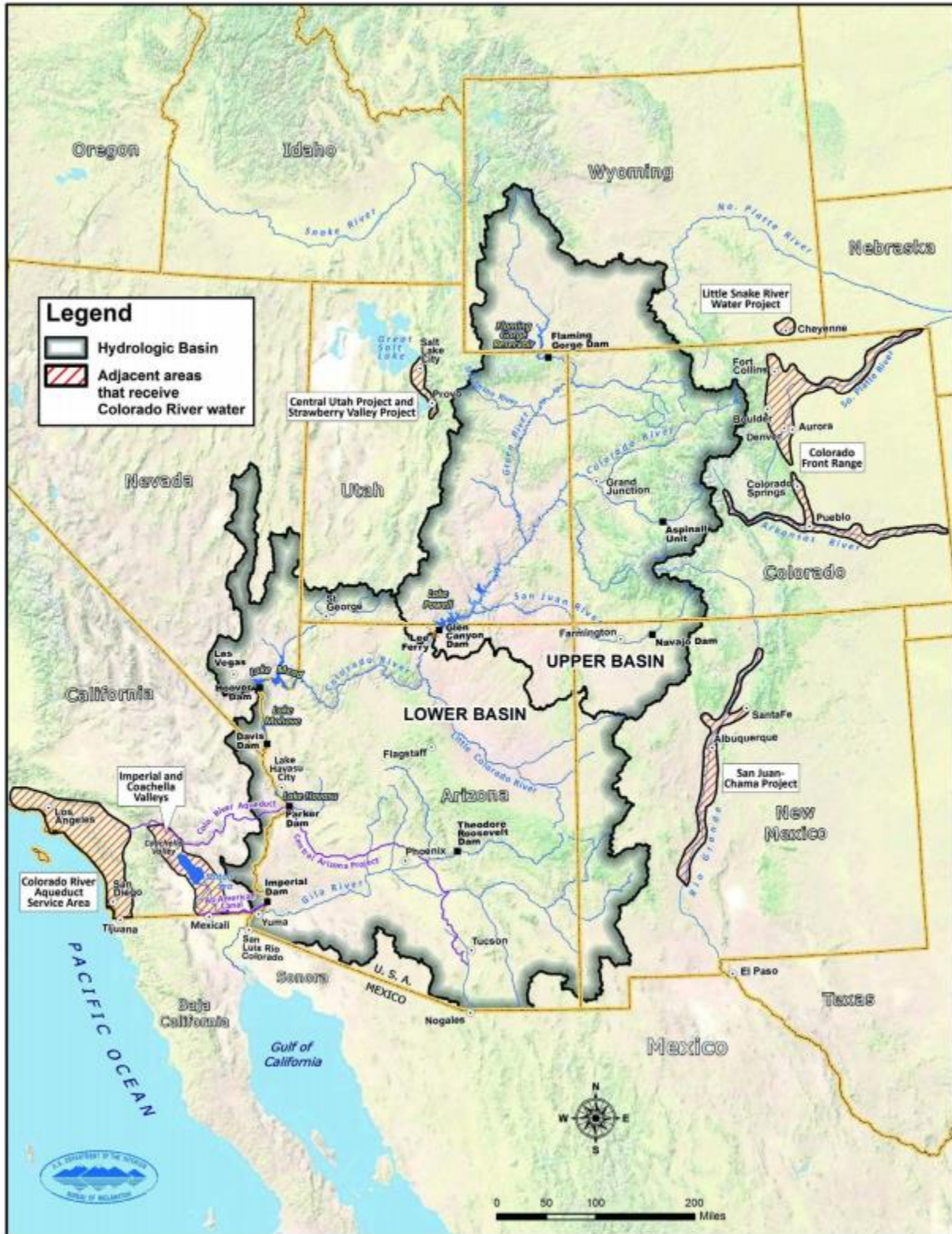
Figure 1: The Colorado River Basin