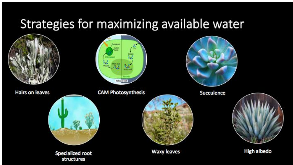
Figure 2. Overview of the physical methods plants use to maximize water.