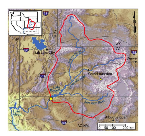
Figure 1. Map of the Upper Colorado River Basin.

Forests in the western U.S. have seen dramatic changes in forest structure and ecosystem processes in response to climate change and altered disturbance regimes. Changes in forests influences precipitation dynamics and runoff of water from snow, which is critical because the seasonal snowpack of the western U.S. is a "natural water tower" that provides 53% of all runoff across the west and 75% of water in the Colorado River (Li et al. 2017). Snow dynamics are essential to understand given that 1/6 of the world's population depends on surface water supplies from snowmelt systems (Barnett et al. 2005), including 40 million people who rely on the Colorado River for water (Deems et al. 2013). Most of the snow in the western U.S. falls in forested areas, where vegetation controls accumulation and ablation of snow (Varhola et al. 2010, Trujillo and Molotch 2014). Warming climate is expected to both decrease the fraction of